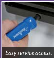
Easy service access.